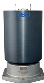
SISTO-C LAP (aluminium) MD168-MD202